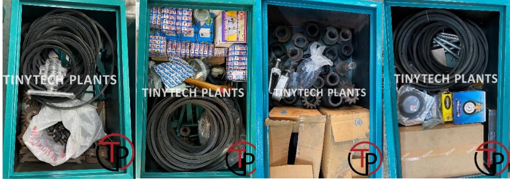
ACCESSORIES & SPARE PARTS.

एक्सपेलरमे चेम्बर बिना वजन उठाये ही मिजागरेपे खुलता है ।